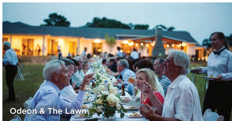
Odeon & The Lawn